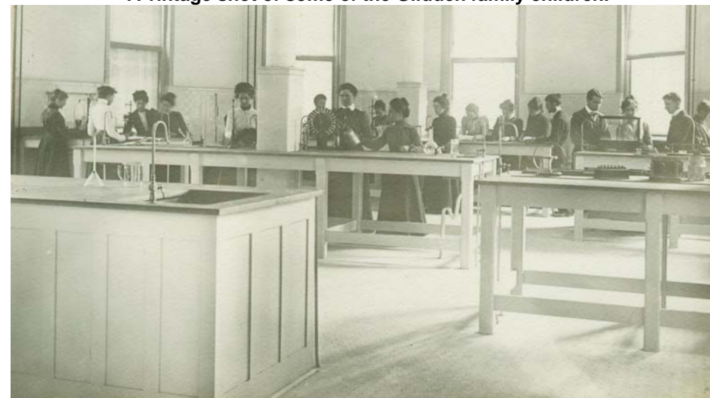
A classroom in Altgeld Hall, NIU's original building.