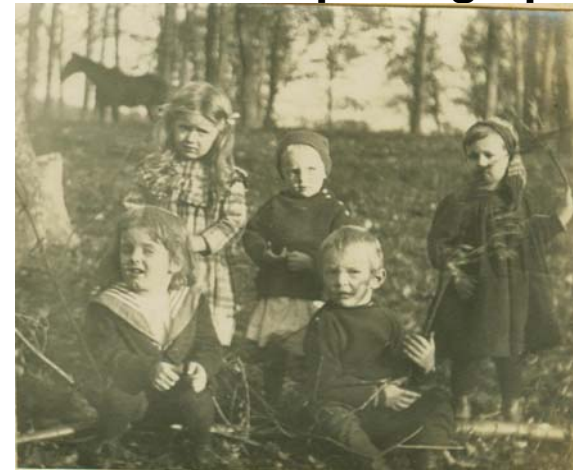
A vintage shot of some of the Glidden family children.