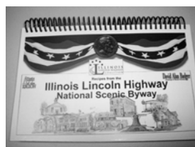
IL Lincoln Hwy Cookbook - $18