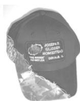
Glidden cap - $12