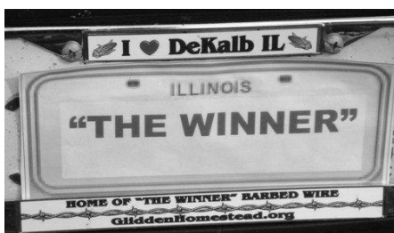
"I Love DeKalb" license plate holder - $15

Visit the Glidden Homestead Gift Shop Sunday, Nov. 21, OR view items online at www.gliddenhomestead.org (items may be picked up by calling 815-756-7904)