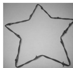
Barbed Wire Star - $4