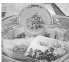
DeKalb Collectibles - $20