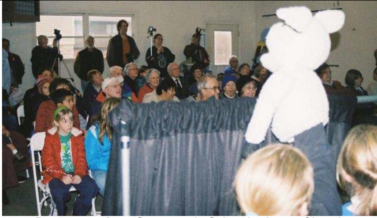
Puppeteers from Sycamore's Salem Lutheran Church entertained at the Glidden Homestead on Nov. 21.