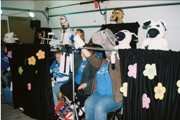
The audience got a rare glimpse behind the curtain at the end of the show Nov. 21, at the Glidden Homestead.

Through the magic of puppets, the story of Joseph Glidden's invention of "The Winner" barbed wire was told at DeKalb's Glidden Homestead and Historical Center Nov. 21. The talented Salem Puppet Praise Team performed as part of the Homestead's annual Antique Toy and Doll Show. Puppet Praise is a team of 15 youth and adults from Salem Lutheran Church of Sycamore who prepare skits and songs of faith for people of all ages. Rod-arm puppets are manipulated from behind a curtained stage to illustrate a message with varied puppet personalities. The puppeteers employ both lip-sync and live microphone techniques in their presentations and shared their original skit along with pre-recorded songs.