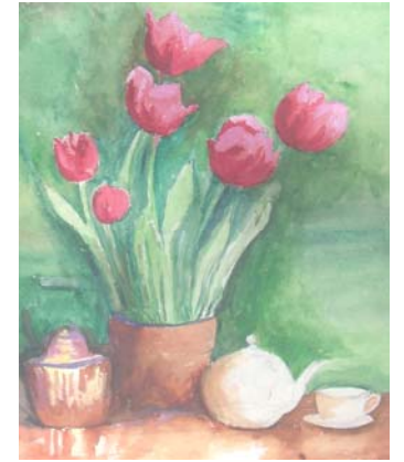
Mabel Glidden Photo Note Cards 7 cards / $6 includes tax

Handmade and featuring photographs of original artwork done by Mabel Carter Glidden, these note cards feature 7 different prints.