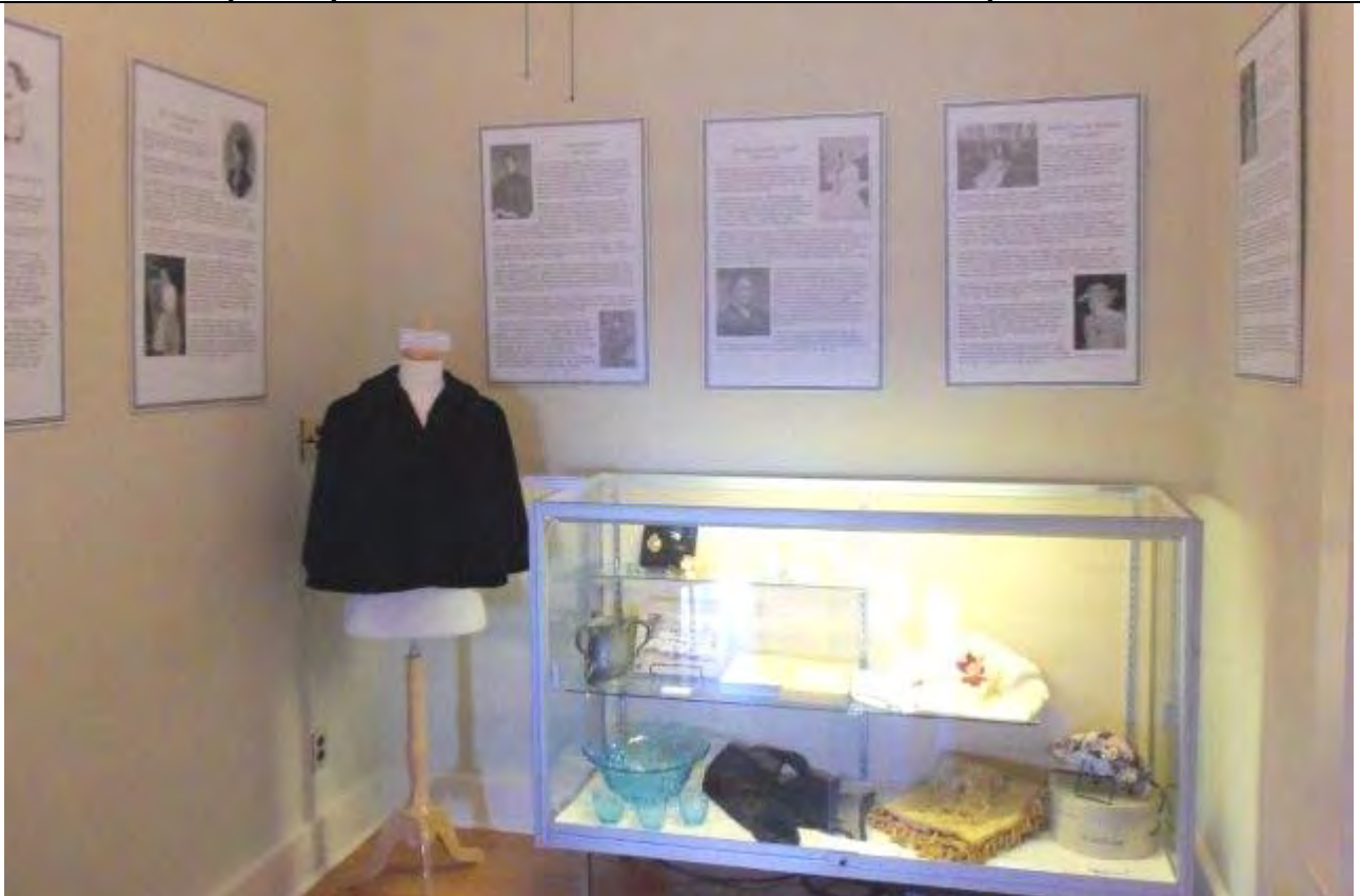
The former office off the East Parlor is now an exhibit space featuring the story of the Glidden women and all of their accomplishments and contributions through the ages.