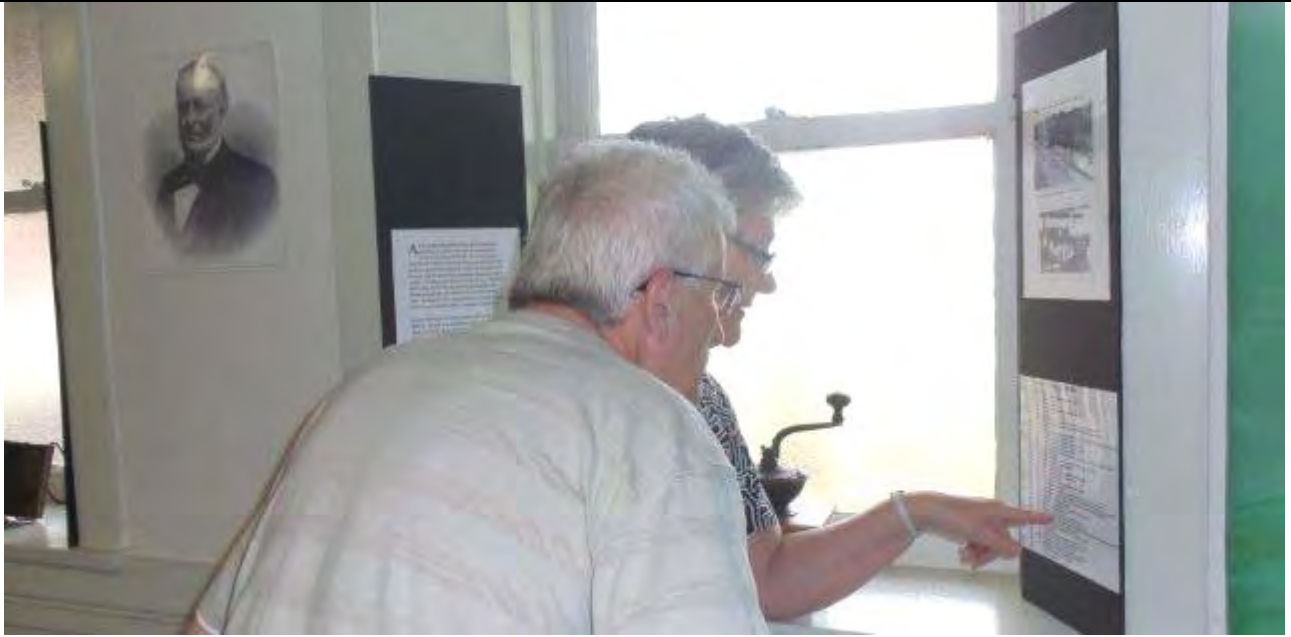
The story of how Joseph F. Glidden used his wife's hairpins to experiment with his idea for barbed wire is told in exhibits throughout the Glidden Homestead.