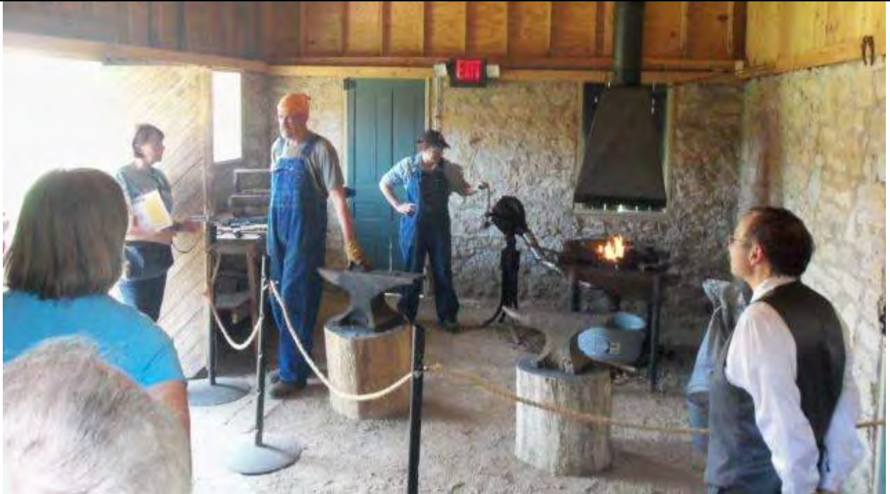
The working Blacksmith Shop at the Glidden Homestead is a popular stop for visitors.