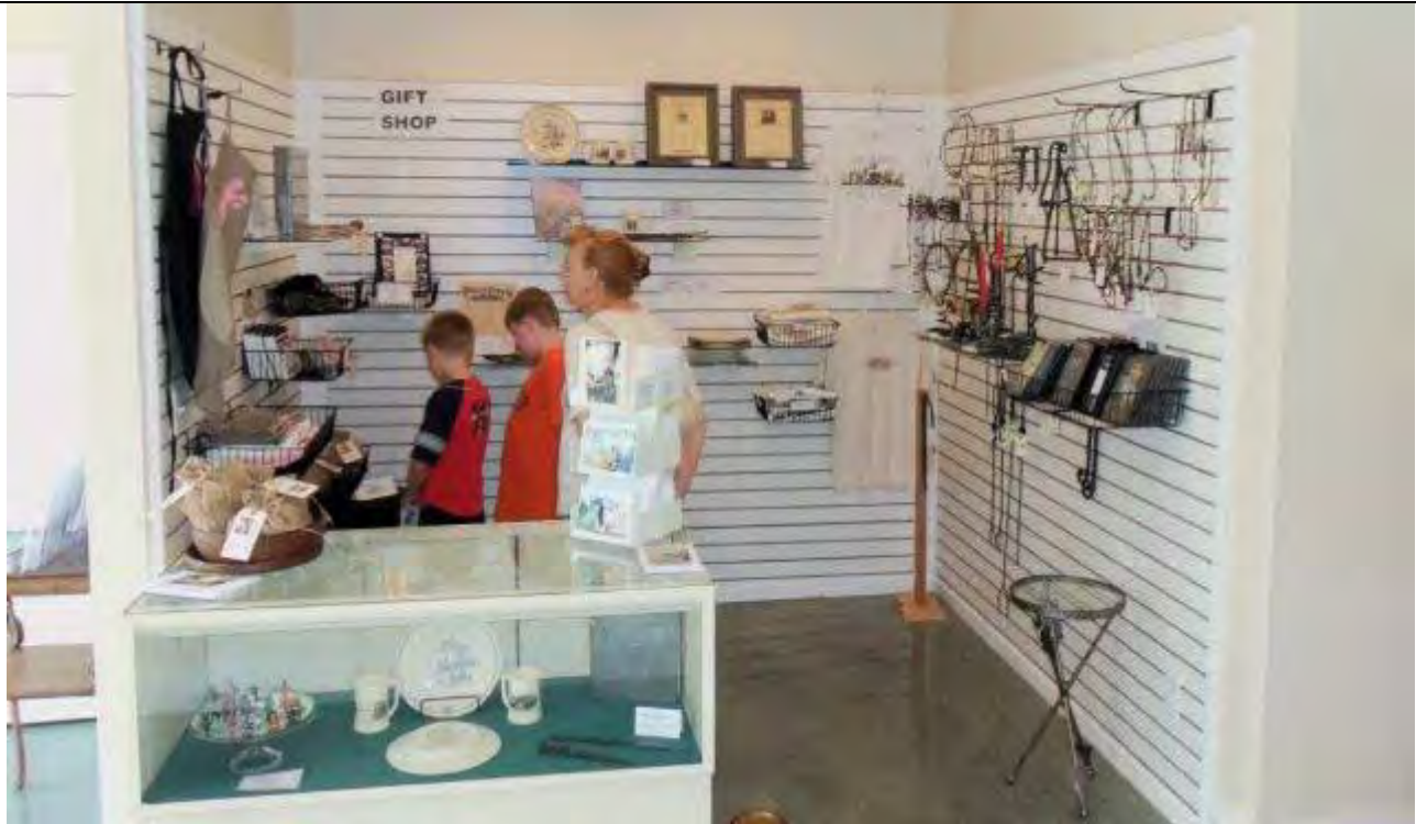
The Glidden Homestead's Gift Shop is filled with unique, one-of-a-kind items including handmade blacksmith creations, barbed wire decorations, DeKalb Centennial and Sesquicentennial collectibles and much more.

Visit the Glidden Homestead this season! We are open from noon-4 p.m., the Second and Fourth Sunday every month through October, with special events in November. Public tours are also given Tuesdays, 10 a.m.-2 p.m.